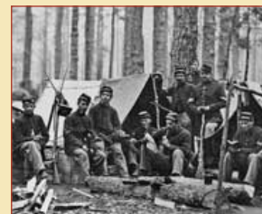
Company F, 4 th Vermont Regiment