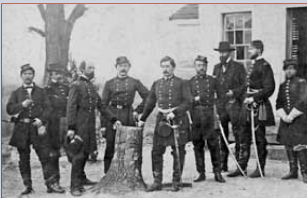
Brady's Incidents of the War.