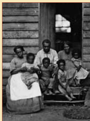
Above: Slaves at the Gaine's House. Below: The 3 rd Regiment at Camp Baxter, a Civil War training camp in St. Johnsbury, 1861

T he Civil War monuments we see today in even the smallest Vermont towns speak to the impact of the war on our state. What was life in Vermont like while the Civil War was raging to the south? How did the Civil War affect Vermont towns and individuals—soldiers, their families, widows, and orphans? A look at the Civil War home front in the North—in Vermont and