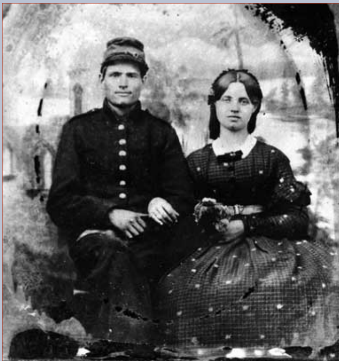
Unidentified couple, 3 rd Vermont Regiment.