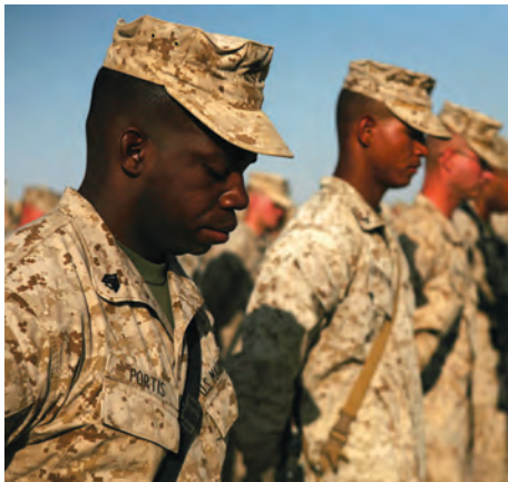
Read and discuss soldiers' stories in a book discussion series at Stowe Free Library.