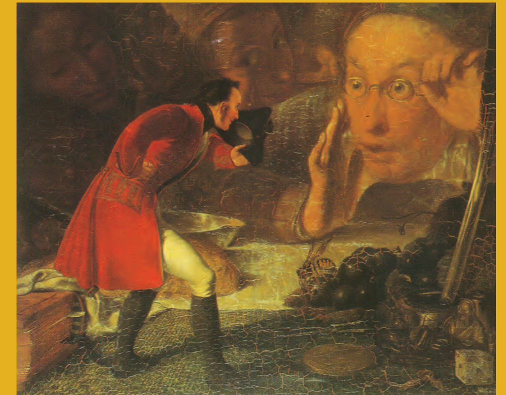
Gulliver in Brobdingnag by Richard Redgrave

Comedy and Satire: It's No Joke From Jonathan Swift to Jon Stewart, Ridiculing Vice and Folly